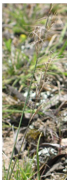
(a) E. Lindsay

Purple Wiregrass(a) and Cork-screw grass (b and c) commonly occur on soil low in nitrogen and carbon.