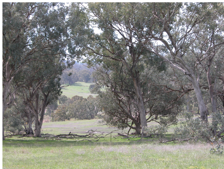
White Box Woodland providing habitat for Scarlet Robins - including different aged trees, logs and litter on the ground!