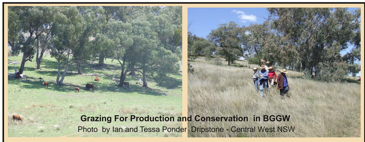
Grazing For Production and Conservation in BGGW Dripstone - Central West NSW

Land managers in the Central West, Namoi and Border Rivers Gwydir CMA regions who have eligible patches of Box Gum Grassy Woodland on their properties will be able to participate in the Environmental Stewardship Program through a tender currently being rolled out for 2010-11. Contact the CW Catchment Management Authority