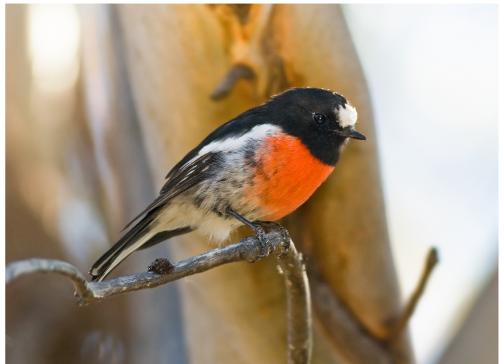
Scarlet Robin ( Petroica boodang )

Birds usually occur singly or in pairs, or occasionally in small family parties. Pairs stay together year-round. In autumn and winter, the Scarlet Robin often joins mixed flocks of other small insectivorous birds which forage through dry forests and woodlands.