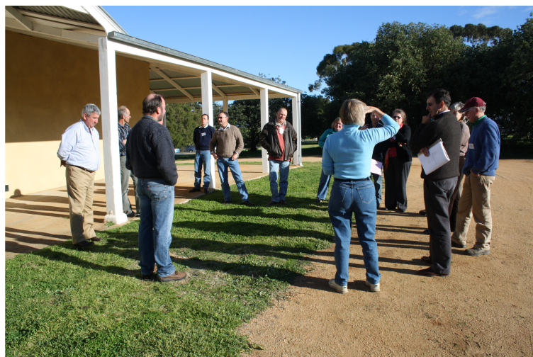
Participants at the second 'Sustainable Farms' stakeholder workshop, Cowra, June 2009.

The future of Australia's paddock trees depends on urgent and widespread management action. While mature trees still exist, they provide sources of seeds for new regeneration throughout the landscape. They thereby offer a window of opportunity to reverse the tree regeneration crisis. These paddock trees must be retained as long as possible.